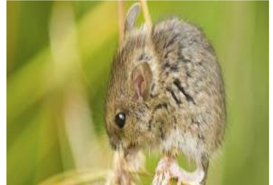
Preble's Meadow Jumping Mouse

Provides the opportunity for the District to review a proposed NWP activity to determine if eligible for authorization