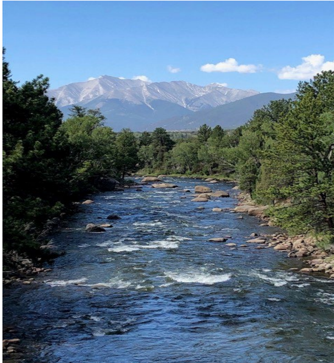
View of the Arkansas River on the Railroad Bridge at the Arkansas Headwaters Recreation Area near Buena Vista, Colorado

https://www.nwo.usace.army.mil/Missions/Regulatory-Program/Colorado/State-Contacts/