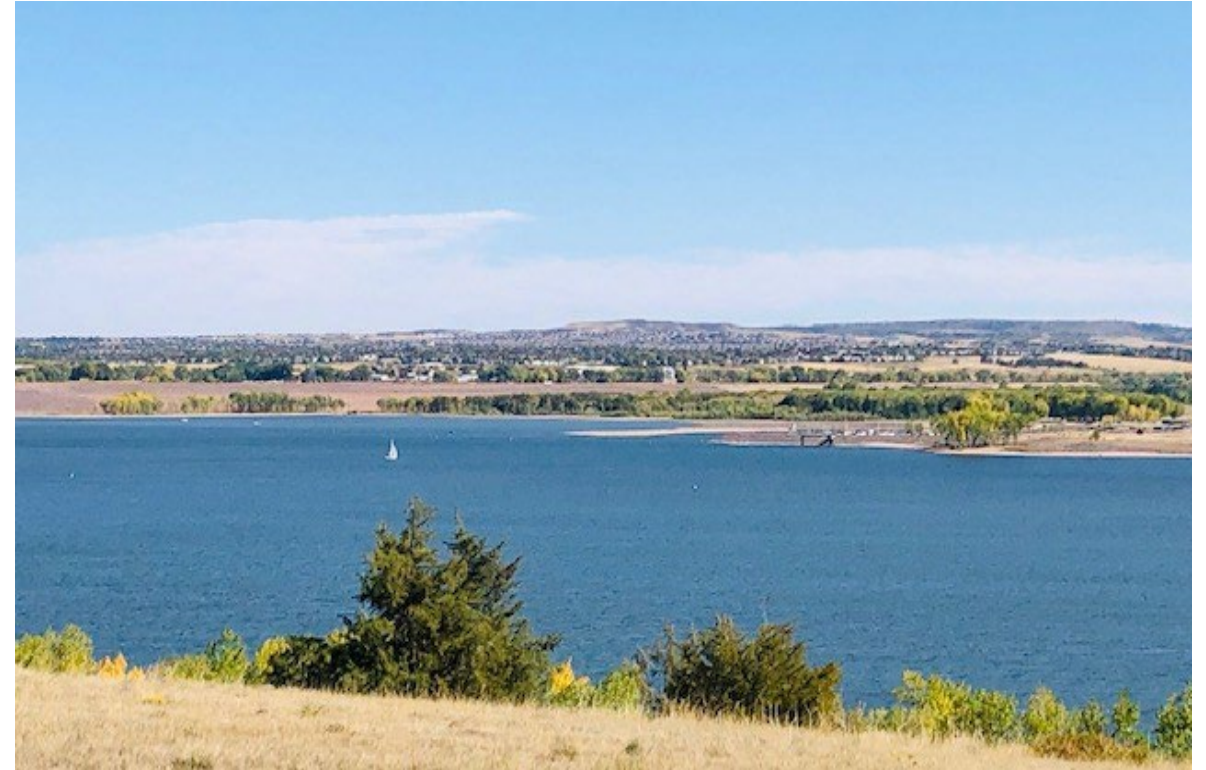
View from the USACE Tri-Lakes Office overlooking the Chatfield Reservoir in Littleton, Colorado